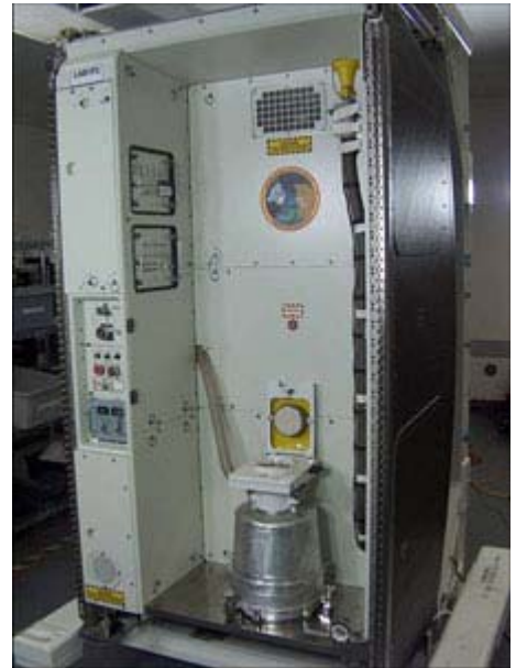
A booth-like compartment holds the new Russian-built toilet system.