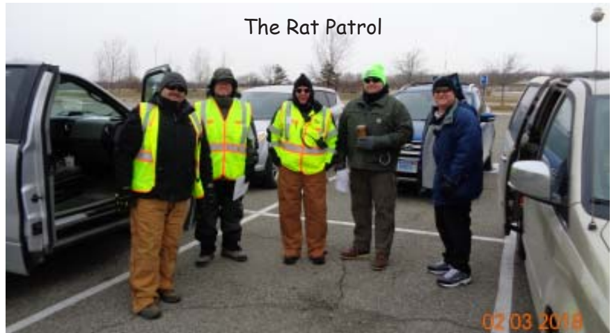
The Rat Patrol